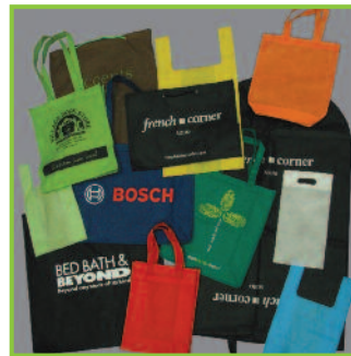
Reusable Non Woven Bags