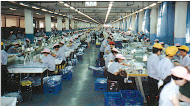
Most expansive PVC bag production line in China