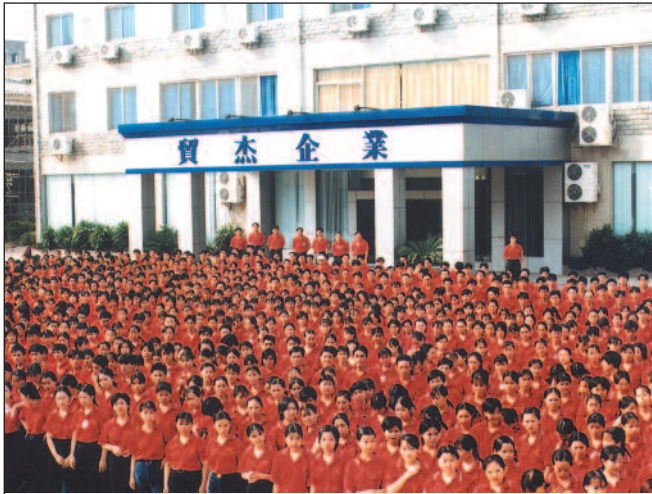
Vipac employees at its facility in Shenzhen, China