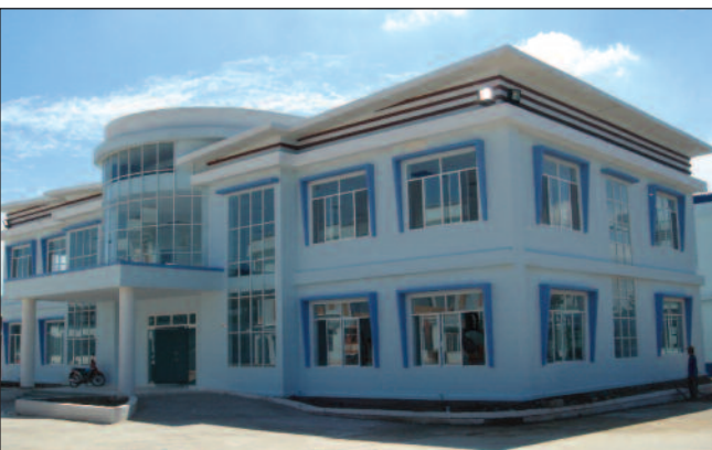
Our corporate and manufacturing complex in Ho Chi Minh City, Vietnam

EDISON, NJ – Vinyl products manufacturer Vipac has been awarded the Cal Safety Compliance Corporation (CSCC) certification after passing an unannounced detailed and comprehensive inspection of its 1,500 employee manufacturing facility in Shenzhen, China. This certification is awarded to manufacturers worldwide in recognition of meeting basic international labor practices and standards.